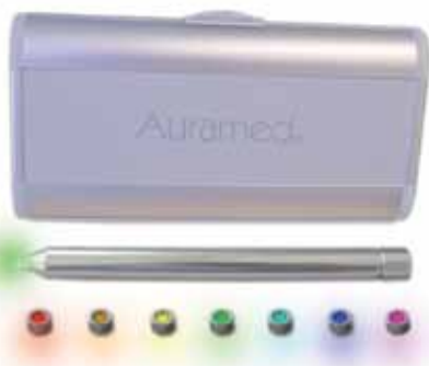
Chromalive Basic II Set

❖ RED: Activates the vitality, metabolism and digestion. Increases heart strength and stimulates circulation. Supports the building of the blood. Encourages willpower.