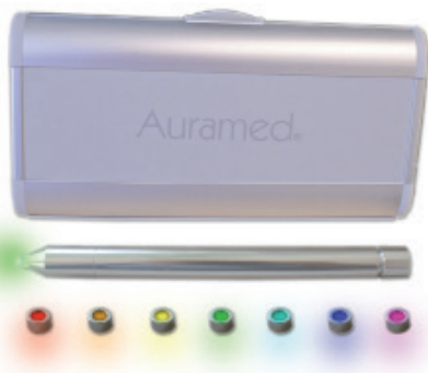
Chromalive Basic II Set

❖ RED: Activates the vitality, metabolism and digestion. Increases heart strength and stimulates circulation. Supports the building of the blood. Encourages willpower.